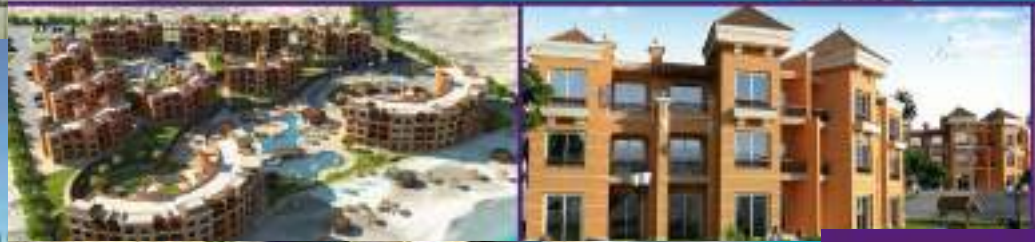
Diamond Resort Class: 4 Stars Location: Marsa Matruh, Egypt