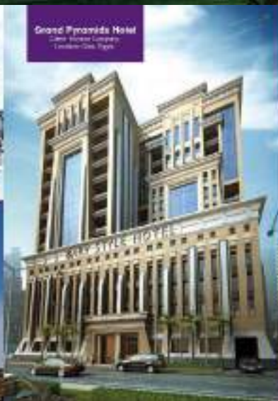
Grand Pyramids Hotel Class: 4 Stars Location: Helwan, Egypt