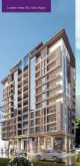
Location: New El-Dokki, Cairo, Egypt