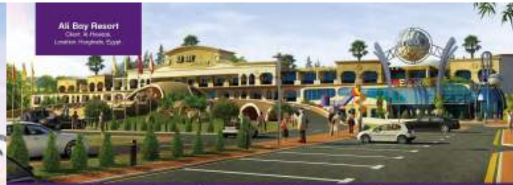
Ali Bay Resort Class: 4 Floors Location: Helwan, Egypt