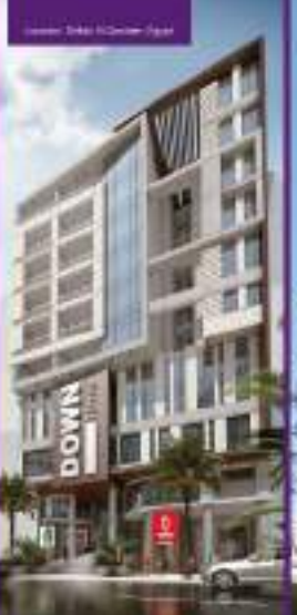
Location: Sheikh Zayed, New Cairo, Egypt