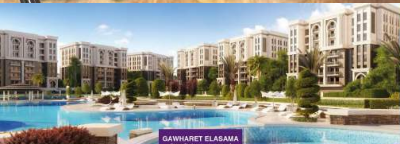
GAWHARET ELASAMA Client: Engineering Authority of Armed Forces. Location: New Capital, Egypt.