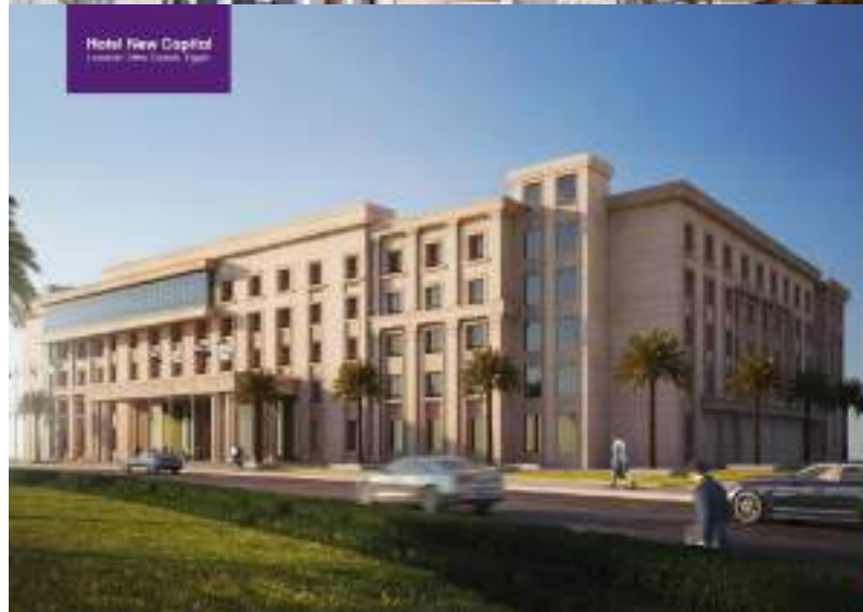
Hotel New Capital Class: 4 Stars Location: Helwan, Egypt