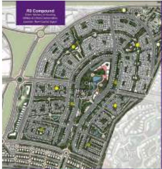
R3 Compound Client: Ministry of Housing, URR&A, El-Dokki, Alexandria, Location: New Administrative Capital, Egypt