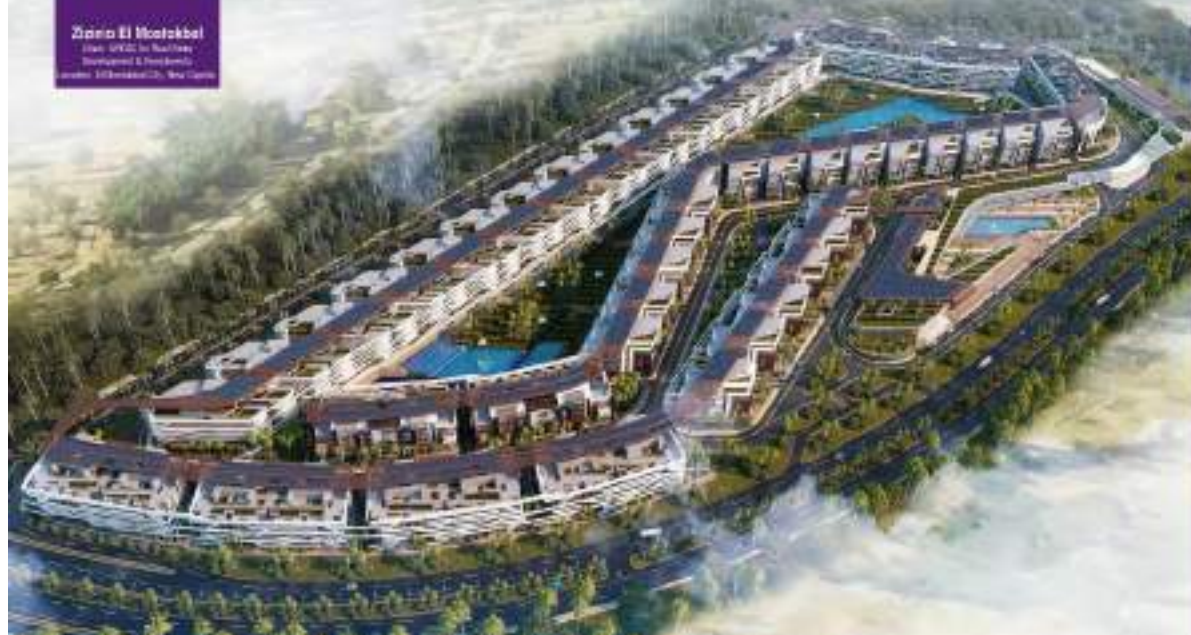
Zain El Mostakbal Client: URR&A, El-Dokki, Development & Real Estate, Location: El-Dokki City, New Cairo