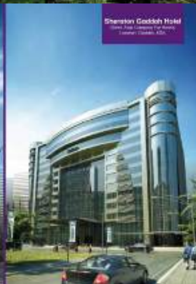
Sheraton Goddess Hotel Class: 4 Stars Location: Helwan, Egypt