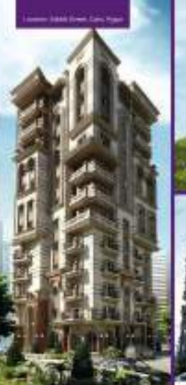
Location: Sheikh Zayed, New Cairo, Egypt