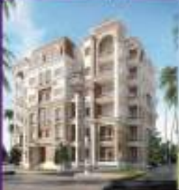
Location: New El-Dokki, Cairo, Egypt