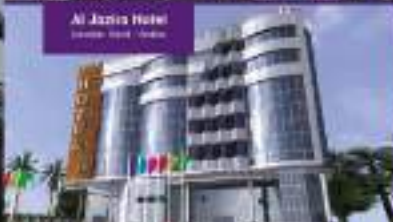
Al Jazira Hotel Class: 4 Stars Location: Helwan, Egypt