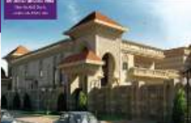
El Alfi Mostakbil Client: URR&A, El-Dokki, Development & Real Estate