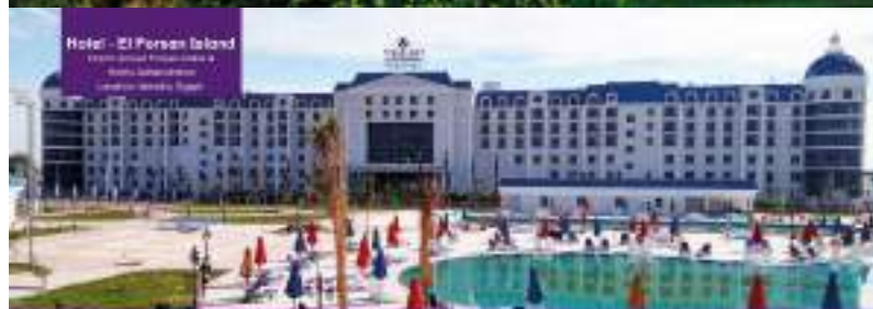
Hotel - El Faraou Island Class: 4 Stars Location: Helwan, Egypt