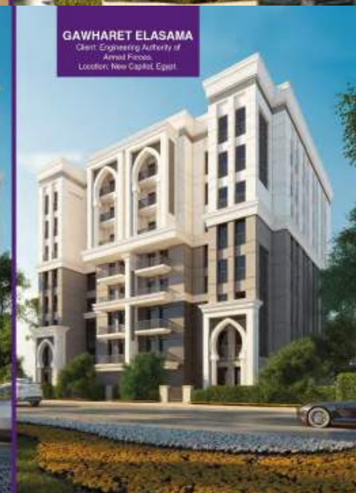
GAWHARET ELASAMA Client: Engineering Authority of Armed Forces. Location: New Capital, Egypt.