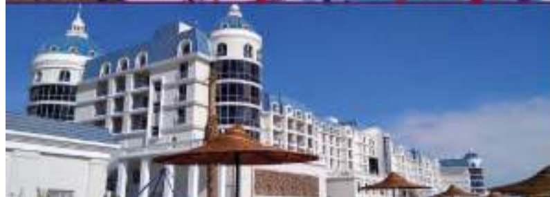
Hotel New Capital Class: 4 Stars Location: Helwan, Egypt