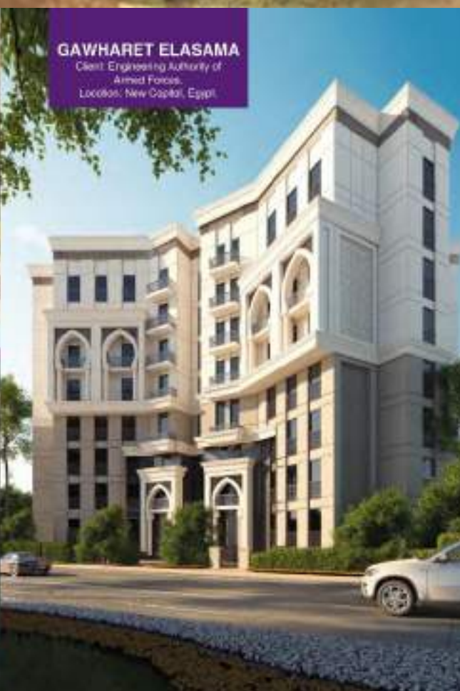
GAWHARET ELASAMA Client: Engineering Authority of Armed Forces. Location: New Capital, Egypt.