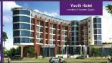
Youth Hotel Class: 4 Stars Location: Helwan, Egypt