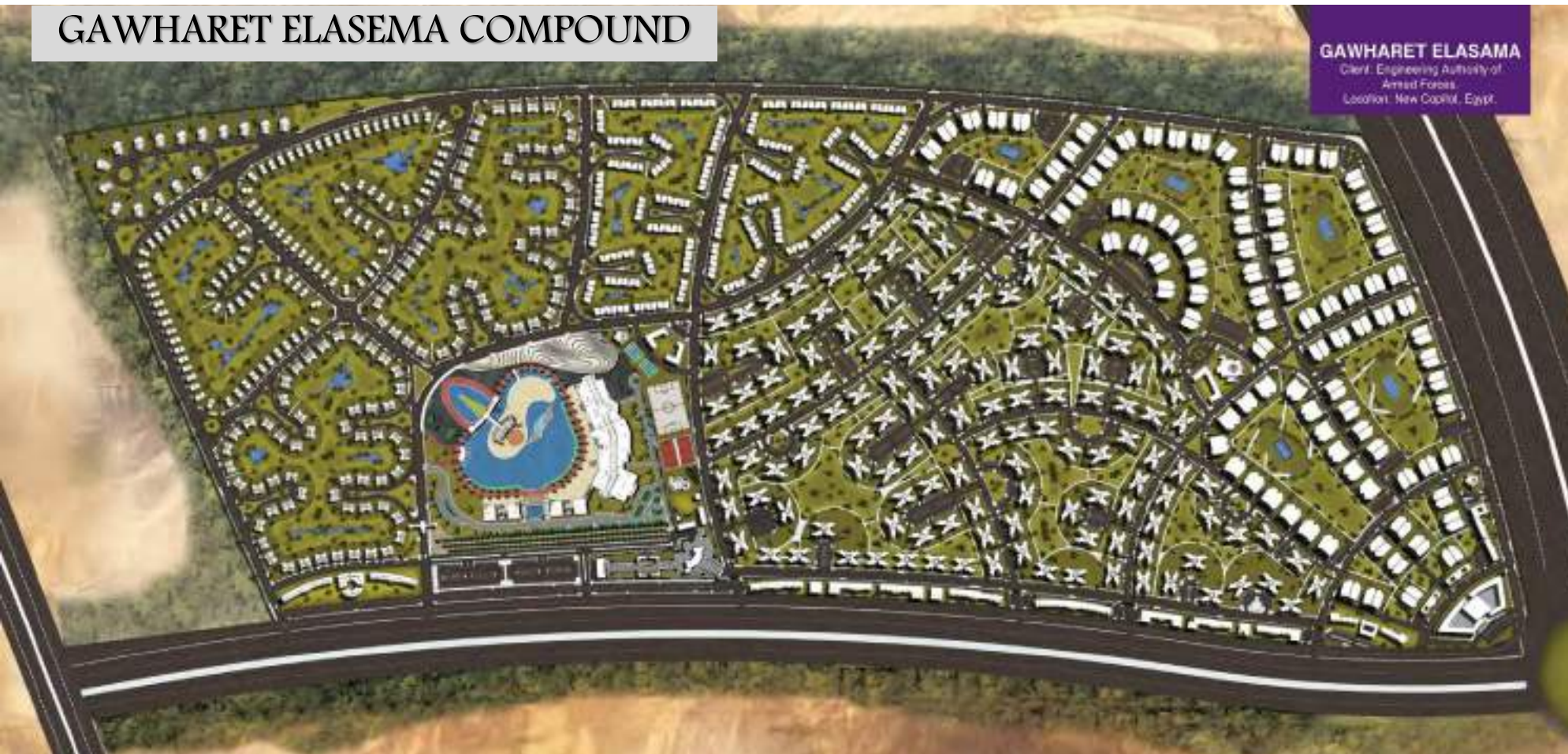
GAWHARET ELASAMA Client: Engineering Authority of Armed Forces. Location: New Capital, Egypt.