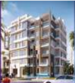
Location: Sheikh Zayed, New Cairo, Egypt