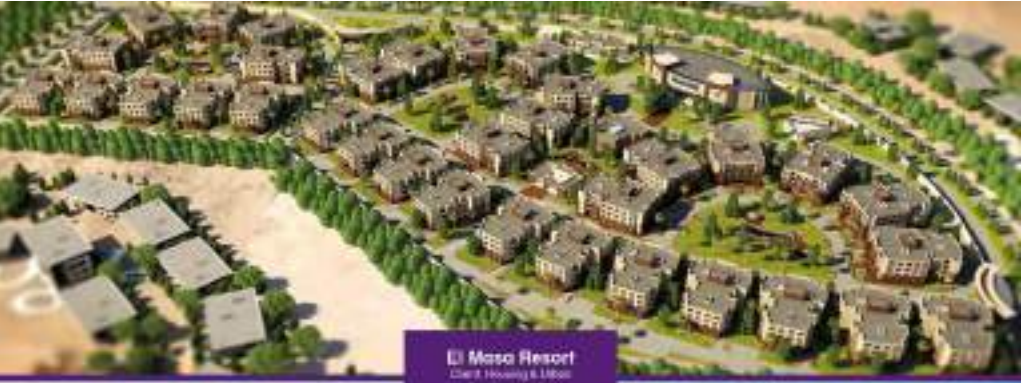
El Masa Resort Client: Housing & Urban Development Co. Location: Ain el-Dokki City, Egypt