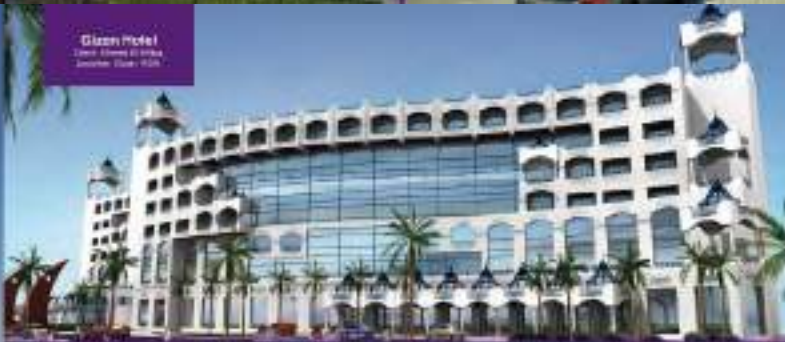
Giza Hotel Class: 4 Stars Location: Helwan, Egypt