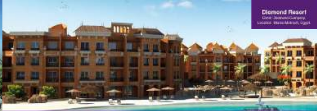
Diamond Resort Class: 4 Stars Location: Marsa Matruh, Egypt