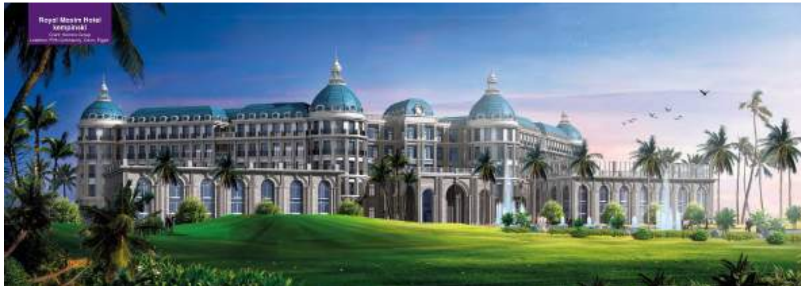
Royal Masara Hotel Class: 5 Stars Location: Helwan, Cairo, Egypt