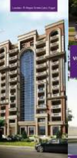
Location: El Beira Street, Cairo, Egypt