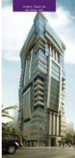
Location: Sheikh Zayed, New Cairo, Egypt