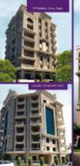
El Nakary, Cairo, Egypt